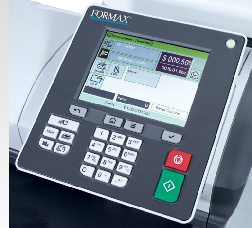
Large Color Touchscreen & Soft Keys Models: Mint 310 Series