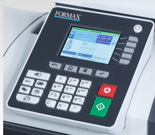
Medium Screen & Soft Keys Models: Mint 210 Series