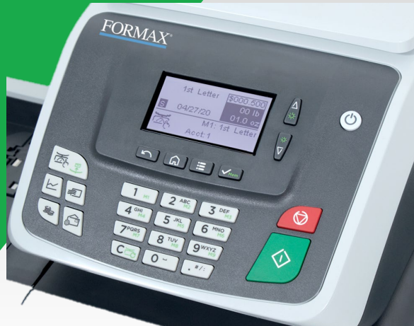
Small Monochrome Screen & Soft Keys Models: Mint 110